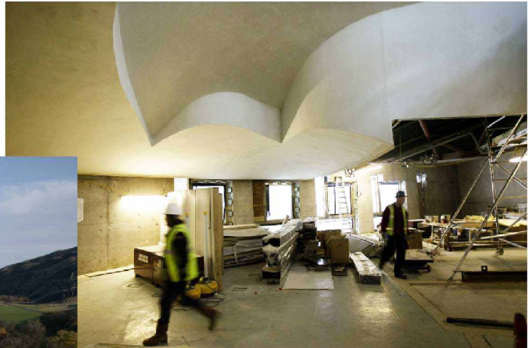
Inside Tower 3 work progresses on fit-out. The above image shows an example of the complex geometry of ceiling structures throughout the four towers.

Installation of services and fit-out across the Ministerial accommodation is now well underway.