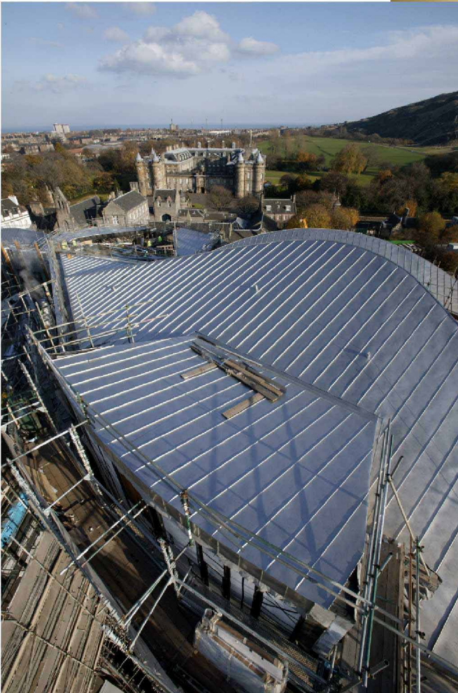
Looking down from Tower 2 onto Enric Miralles' curved, stainless steel-clad roof of Tower 1.

Fit-out is progressing well in the Committee Towers with internal screens being installed. All six of Parliament's Committee rooms will be housed in Towers 1 and 2.