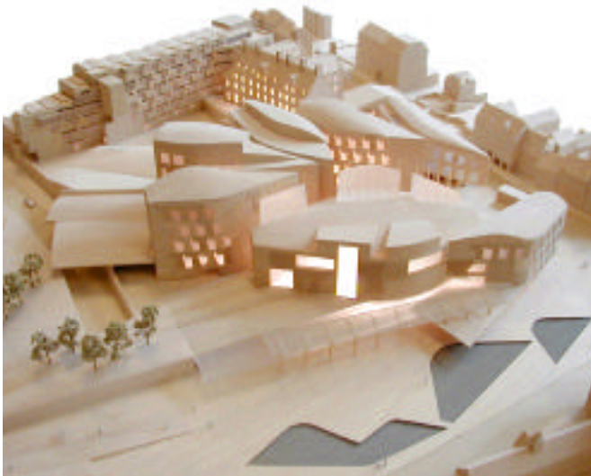
Model of Parliament complex - April 2000

completion date of December 2002. On 5 April following a debate Parliament voted to continue with the Project on that basis.