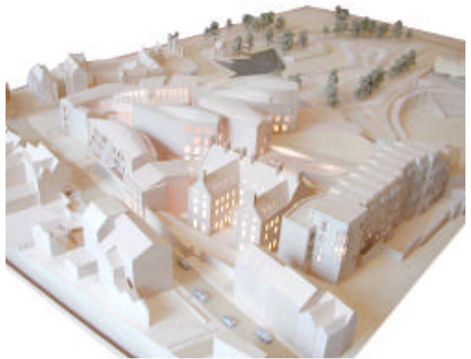
Model of Parliament complex - April 2000

During the early months of the new Parliament being in operation day to day working practices were