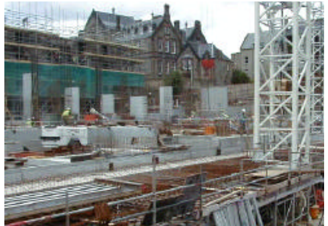
MSP building, garden level - May 2000

In May of this year scaffolding, including a temporary roof structure, was erected around Queensberry House, to allow the removal of existing external render. Work on the refurbishment of this building will commence shortly.