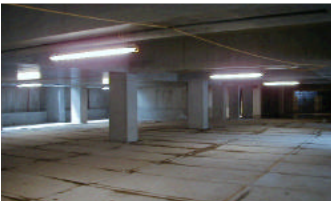
Basement of MSP building - May 2000

Construction work on the substructure of the MSP building, on the west side of the site (next to the Teague Homes development) began in September 1999, and practical completion of the basement was achieved in April 2000. Work on the superstructure of the MSP building is now well under way. A number of sections of the superstructure are being prefabricated off-site and will be transported to the site for construction. As the prefabricated units are put in place at a rate of up to 4 per day the MSP building will rise quickly over the next few months.