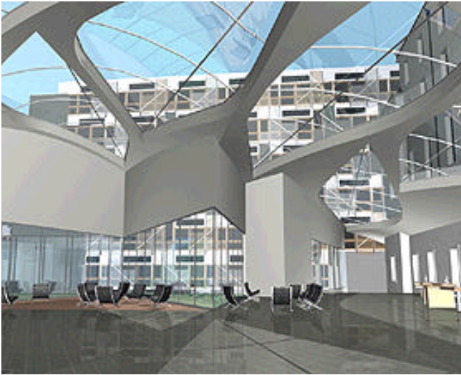
Foyer space looking west to MSP building