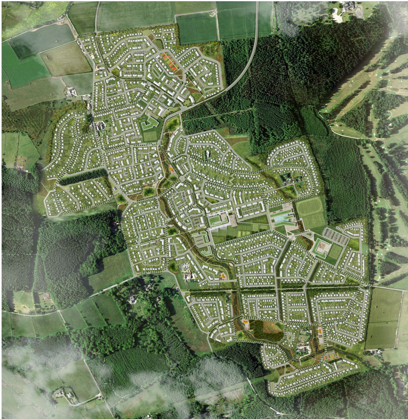
Aerial view of the Countesswells neighbourhood in Aberdeen, which we exhibited at our LAUDE event on market-led housing .

“We aim to live in a Scotland where a well-designed built environment supports sustainable, resilient communities which meet the needs of all.”