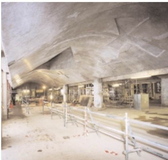
Vaulted ceiling in the public foyer

On 9 December a new Building Information Centre opened in the Tun on Holyrood Road. The new Centre contains models, plans and computer generated images of the new building, samples of internal and external finishes, video and touchscreens. A Parliament shop selling a range of Parliament merchandise is due to open within the next few weeks. The Centre is open every day from 10.00am to 4.00pm.