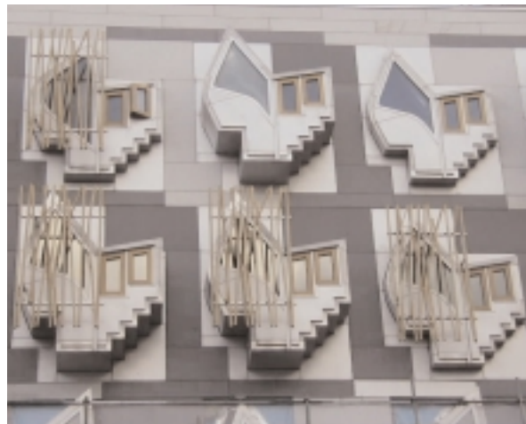
MSP window exterior

Inside the MSP building work continues in fitting out the offices. A purpose built storage wall in a combination of oak and sycamore, manufactured by Ben Dawson of Musselburgh, is one of the features in each of the 106 offices. Other characteristics include a concrete vaulted ceiling unit. Weighing 18 tons each, these units were cast off-site and lifted into place when the in-situ concrete frames were ready to accept them. The intention is that the high standard of concrete finish will be left exposed (i.e. not painted).