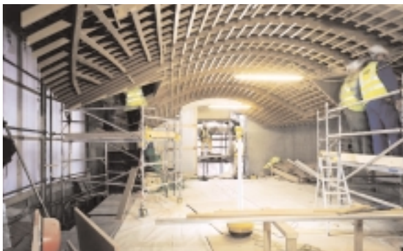
Construction of vaulted ceilings in Committee room

The carcass of the first of the unique shaped vaulted ceilings, which will be a feature in each of the committee rooms, is currently being installed. All 6 committee rooms will provide seating for the press and the public. Committee meetings held in these rooms will be capable of being televised.