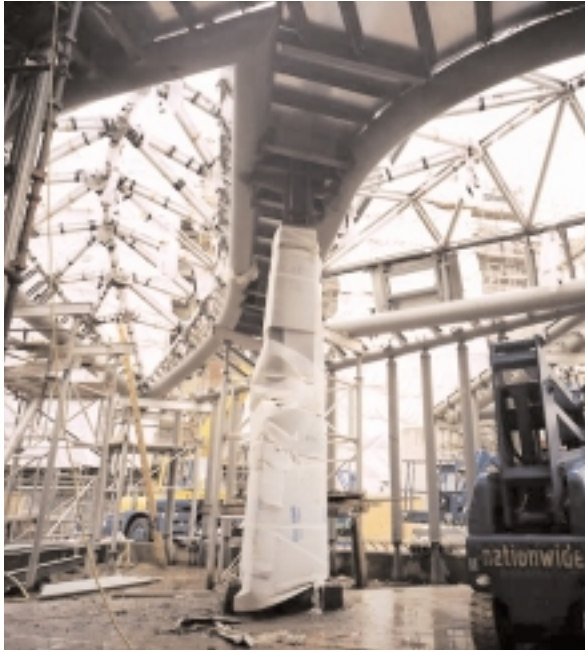
View from underneath lobby roof lights