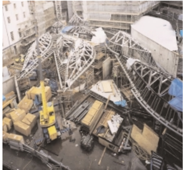
Leaf shaped lobby roof lights