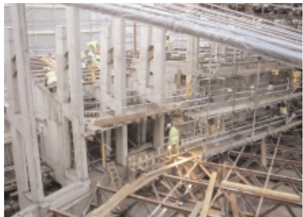
Inside the Debating Chamber

Externally, with the steelwork now in place work is ongoing in preparing the façade of the chamber for the installation of the final cladding. On the media tower, which is connected to the debating chamber, only a few of the high quality concrete panels and oak windows, which clad this building, have to be installed.