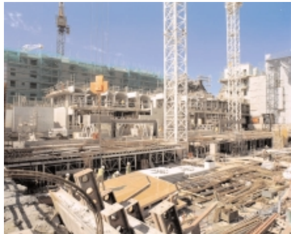
View west across the site - Sept 2000