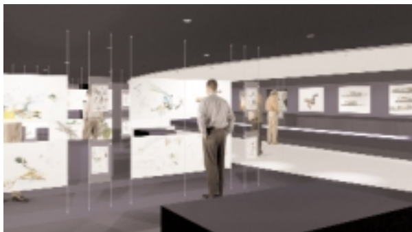
Internal visualisation of Visitor Centre

The area around Holyrood has never been so busy with visitors and – judging by the number of people peering through the gates – the Parliament site is one of the principal attractions. Now that the building is clearly rising out of the ground there is plenty to see from the pavement but there are other, better ways of making building projects accessible to people.