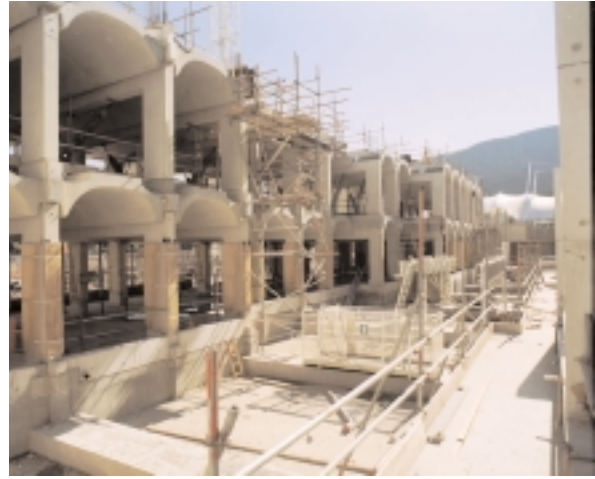
Above & Below: MSP block under construction Sept 2000

The so-called 'north core' (stairs and liftshaft) is almost complete and the vaulted ceilings of the individual MSP rooms on the ground and first floors are all in place. It is now possible to walk up and down the corridors on the first and second floors and in and out of over 40 MSPs' rooms.