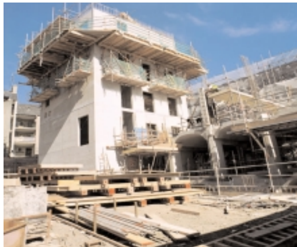
The "North Core"

The basic construction of the MSP block is on programme for completion by mid January 2001. At that point the building will appear largely finished from the outside although the essential services and fittings which enable the building to be used will not be installed until the whole complex is ready for occupation. Once construction is complete across the whole site, the detailed testing and preparation of the building for occupation can begin.