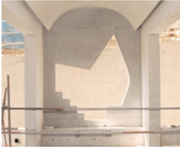
Profile of an MSP window